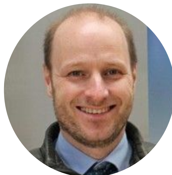
Graeme Cook Scottish Parliament