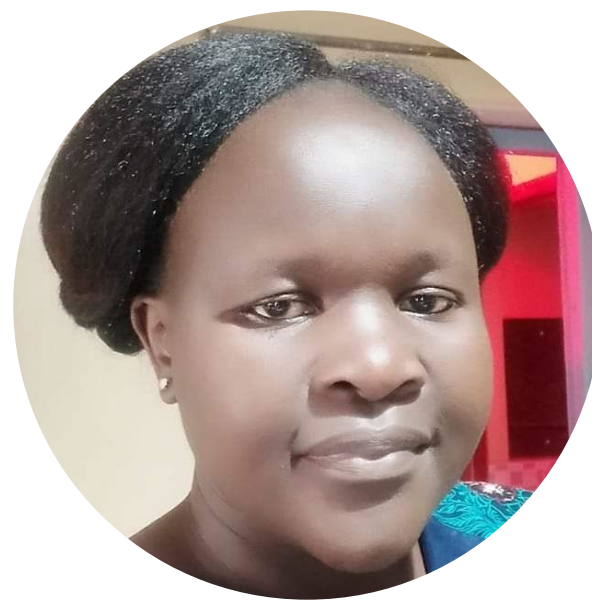
Philista Malaki National Museums of Kenya (Kenya)